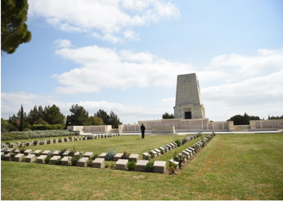
undogan visited Lone Pine Cemetery, Chunuk Bair (New Zealand) Memorial and Iwalek Memorial alone.