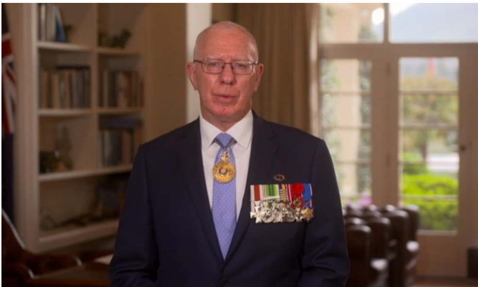
rnor-General David Hurley paid tribute to the service and sacrifice of Australians ; first Anzac Day address.

"Like all who landed at Gallipoli that day, he was a man who lived his life in the service of others," she said.