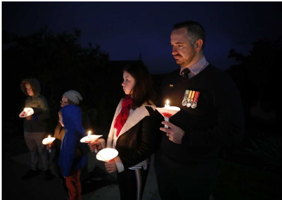
Thoades family gathers outside their home in Canberra for a unique Anzac Day service.

While others played the Last Post in the streets outside — or in one Queensland girl's case — the paddock outside.