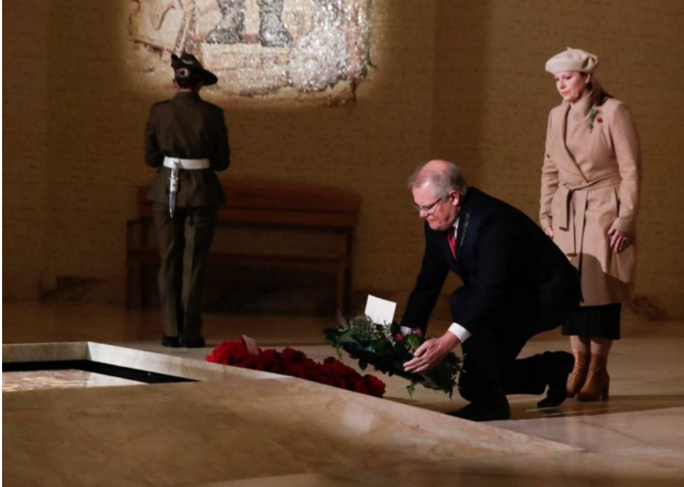
Minister Scott Morrison and Jenny Morrison lay a wreath at the Tomb of the Unknown Australian Soldier.

"Our remembrances today small, quiet and homely will be," he said.