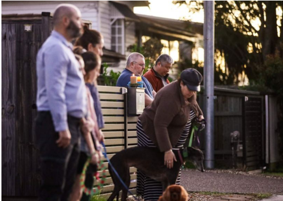
People gathered kerbside this morning to remember the fallen in the Brisbane suburb of Deagon.

"With everyone not able to get out to the commemorations this morning, I thought I just better do what I could in terms of being a brass player," he said.