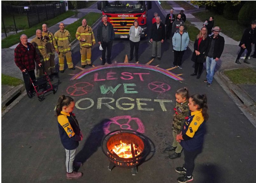
Residents in Clara Street, Macleod gather at dawn on Anzac Day in Melbourne.