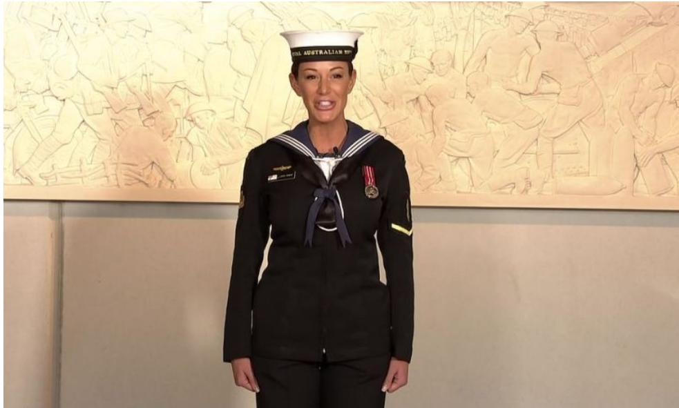
onal Anthem at Sydney Anzac Day service