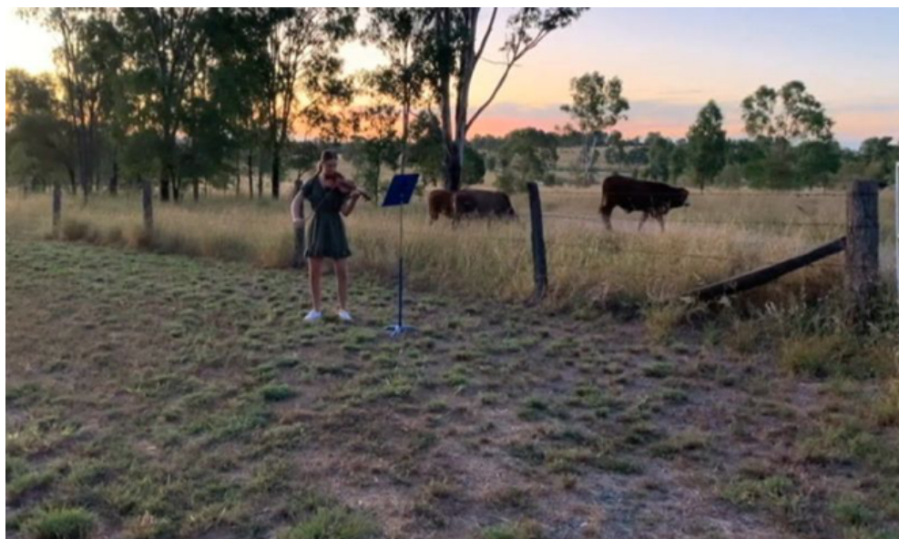
Post played on violin in a Queensland paddock

While others played the Last Post in the streets outside — or in one Queensland girl's case — the paddock outside.