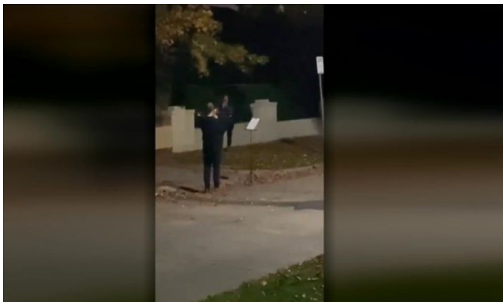
Australians hold driveway dawn services for Anzac Day

RSOs around the country have asked Australians to take a moment to mark their respects from home.