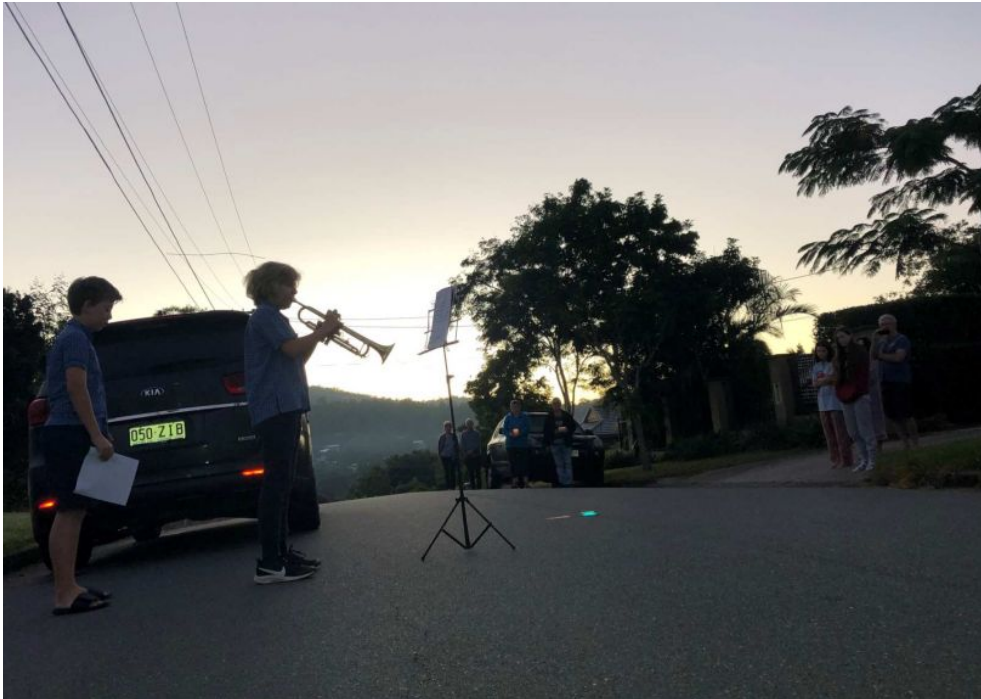
Id plays the last post on the morning of Anzac Day at The Gap in Brisbane.

Others lit up the dawn with candlelight vigils, with several people playing The Last Post in their neighbourhoods.