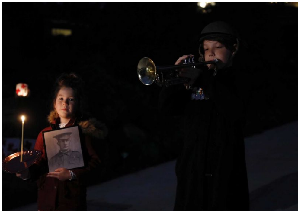
Children around the country played The Last Post for their neighbours.

RSOs around the country have asked Australians to take a moment to mark their respects from home.