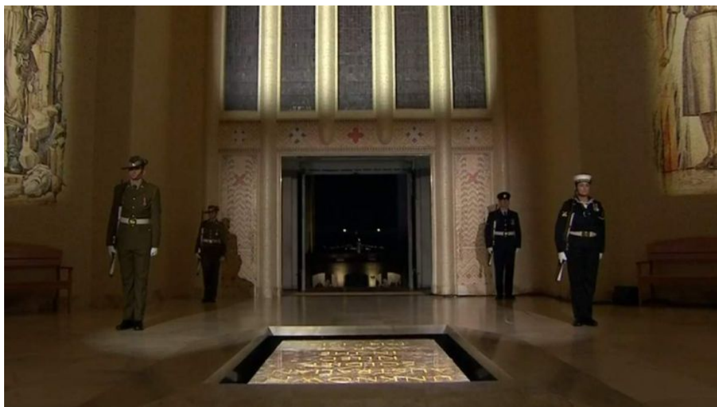
Dawn service held at Australian War Memorial

Posted Sat 25 Apr 2020 at 6:57am, updated Sat 25 Apr 2020 at 11:57pm